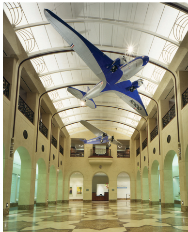
Aviation Museum at SFO

difficulties escalated. I have been collecting aviation memorabilia for most of my life and had been working with Pan Am when I was in the Air Force in the 1960s. In addition to my personal collecting we began collecting on behalf of the Airport. When Pan Am sold its Pacific division to United Airlines, Pan Am was kind enough to donate everything in its hangars and offices to the Airport. As the years went by, I wrestled with what we should do with this valuable and