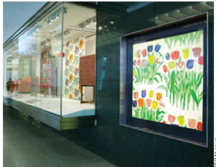
The Enduring Designs of Josef Frank Gallery Perspective 1 SFO International Terminal Main Hall

SFO Museum has been able to successfully bring the museum experience to a wide audience of the close to 40 million annual passengers and the more than 23 thousand people who work at the Airport every day. The museum's staff of curators develop the exhibition storylines, select the objects to be shown, and write the label texts. The exhibition designer and the graphic designer create the layout of the objects, select the colors, and create the panels for the didactic and two-dimensional materials. The planning and production of exhibitions is done in compliance with the standards of the museum profession regarding care