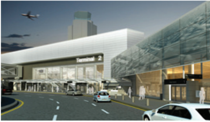
San Francisco International Terminal 2 departures level approach rendering 2010

the South Terminal and the North Terminal in the 1960s and '70s, now Terminal 1 and Terminal 3 respectively. It then served as the International Terminal until it was closed in 2000 when the new International Terminal opened.