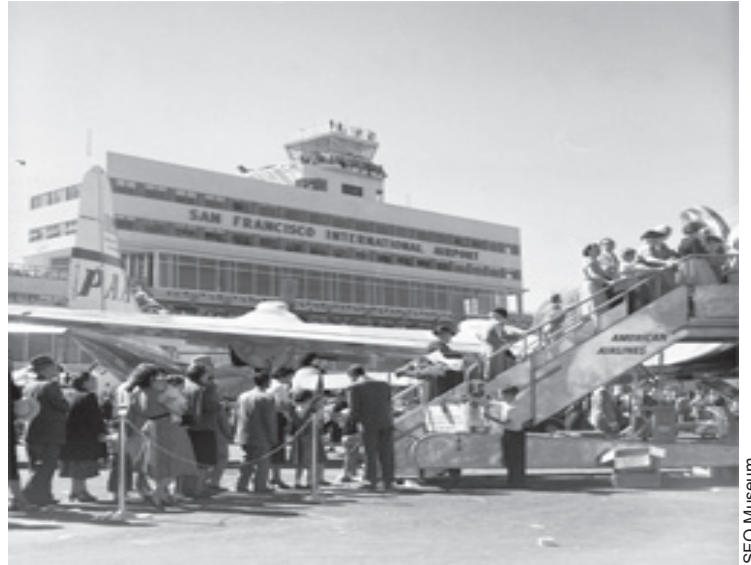
Terminal Building opening celebration 1954

By 1930, the location was declared suitable, and commercial aviation's growth appeared certain. 1,112 acres were purchased by the city—including the original 150-acre parcel—and renamed San Francisco Airport. Expansion of the airfield and